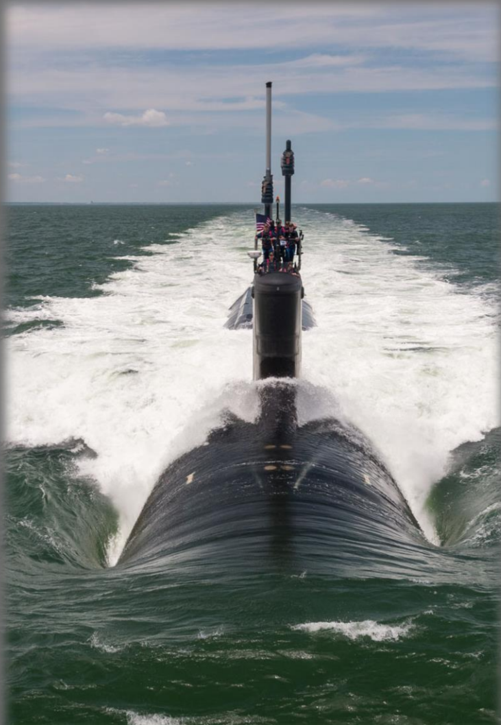
USS John Warner (SSN 785) on sea trials.