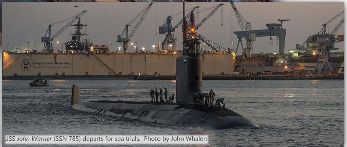
USS John Warner (SSN 785) departs for sea trials.

Cover page: USS Dwight D. Eisenhower (CVN 69)