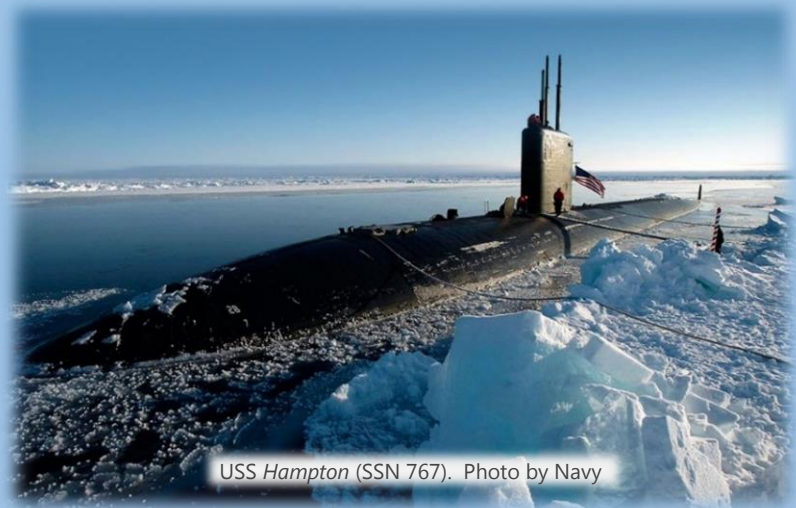
USS Hampton (SSN 767).

To be successful and maximize the efficiency of our interactions, we need our supplier's input and recommendations. The success of our supply base is critical to our success and ultimately the success of the Navy. As we define the future of our iDS Supplier Interface and Collaboration initiative, we want our suppliers to play a significant role in helping shape that vision. We will reach out to select suppliers to participate in pilot projects after the details are established. We look forward to collaborate with suppliers and together we will fully realize the benefits of iDS. Please contact us at SupplierSuggestionBox@hii-nns.com for any question regarding iDS.