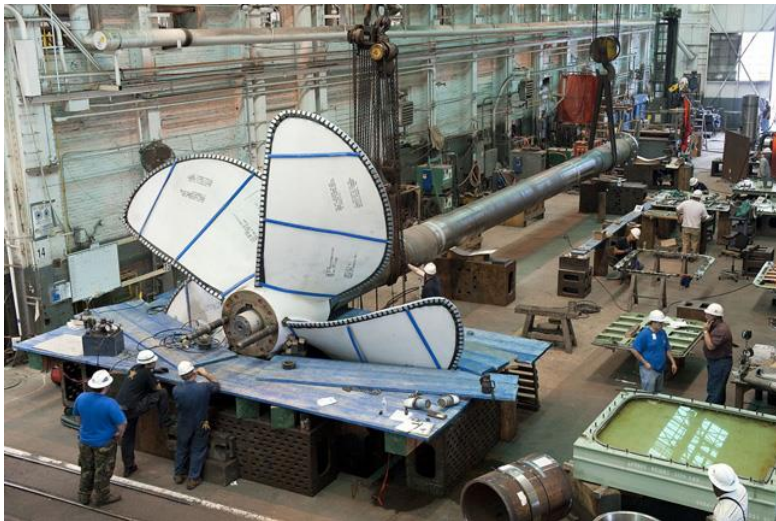
One of the first propellers for the Gerald R. Ford (CVN 78) is fitted to a shaft in the main Machine Shop.