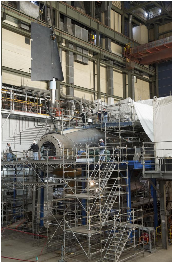
Shipbuilders install the upper rudder on the submarine South Dakota (SSN 790).

http://supplier.huntingtoningalls.com/sourcing/sup_training.html