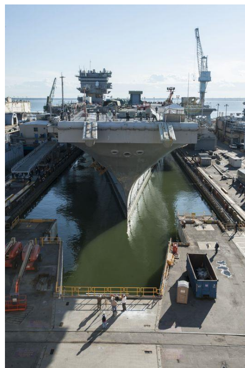
USS Enterprise enters Dry Dock 11, the carrier's original birthplace.