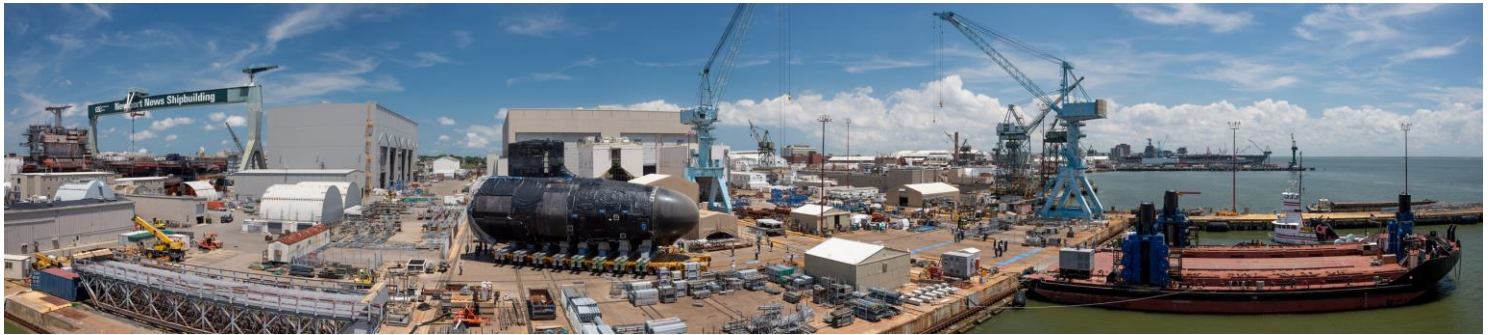
A panorama of Newport News Shipbuilding taken from the Floating Dry Dock showing the bow unit of submarine Illinois (SSN 786) being moved to the sea shuttle.