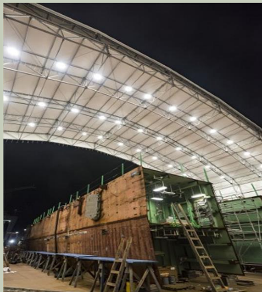
John F Kennedy, CVN 79 Carrier Construction, FAB.

Remember to maintain all pertinent information involving the qualification of a procedure until it has been approved by the Navy to help ensure a painless and quick approval time.