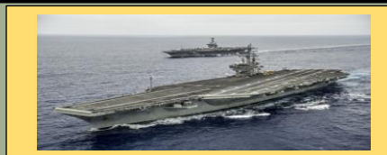
USS Ronald Reagan (CVN 76) with USS George Washington (CVN 73).