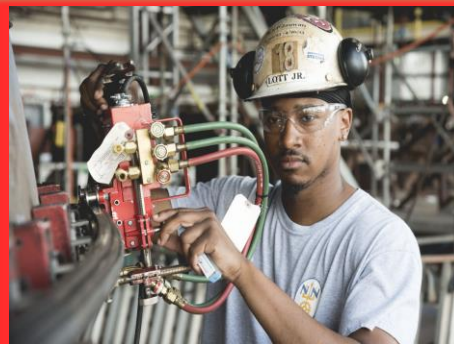
Worker adjusting his machine while working in the Ring Module Shop.

Starting in May 2019, the Supplier Engineering group at NNS will begin executing ISAs at key, critical suppliers. The purpose of an ISA is to thoroughly evaluate a supplier's personnel, equipment and manufacturing processes during work-in-process (WIP) to ensure that all invoked requirements are being satisfied. Similar to a Supplier Technical Assessment and Validation (STAV) event, which is typically performed pre-award of a Purchase Order, an ISA utilizes a team of subject matter experts and adds in-depth elements to validate supplier understanding and performance. Examples of in-depth elements that may be performed include the following: re-performing NDT on product, performing dimensional checks on product, testing Geometrical Dimensioning and Tolerancing (GD&T) knowledge, observing performance of welding, witnessing the performance of calibration, observing the performance of testing, etc. Due to the increased depth of this type of assessment, an ISA will typically be a three-day event and will also include assessments of sub-tiers performing critical processes, e.g. welding, NDT, assembly, honing, etc.