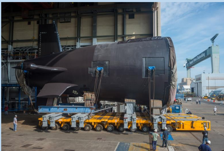
The stern unit of the USS SOUTH DAKOTA (SSN 790).

Expanding this collaborative approach, NNS has been slowly engaging the supplier base to also be innovative – to go above and beyond economy buys, whole ship buys, or two-ship buys of parts and equipment. NNS has even.... continued on page 5