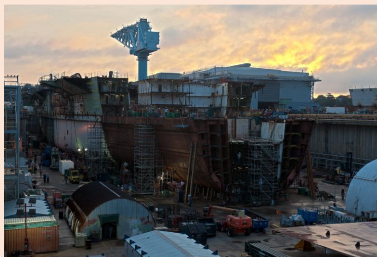
USS GERALD R. FORD (CVN 78) under construction.

http://supplier.huntingtoningalls.com/sourcing/sup_training.html