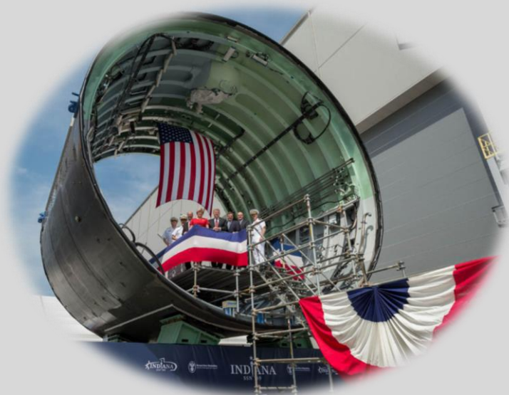
USS INDIANA (SSN 789) Keel Laying