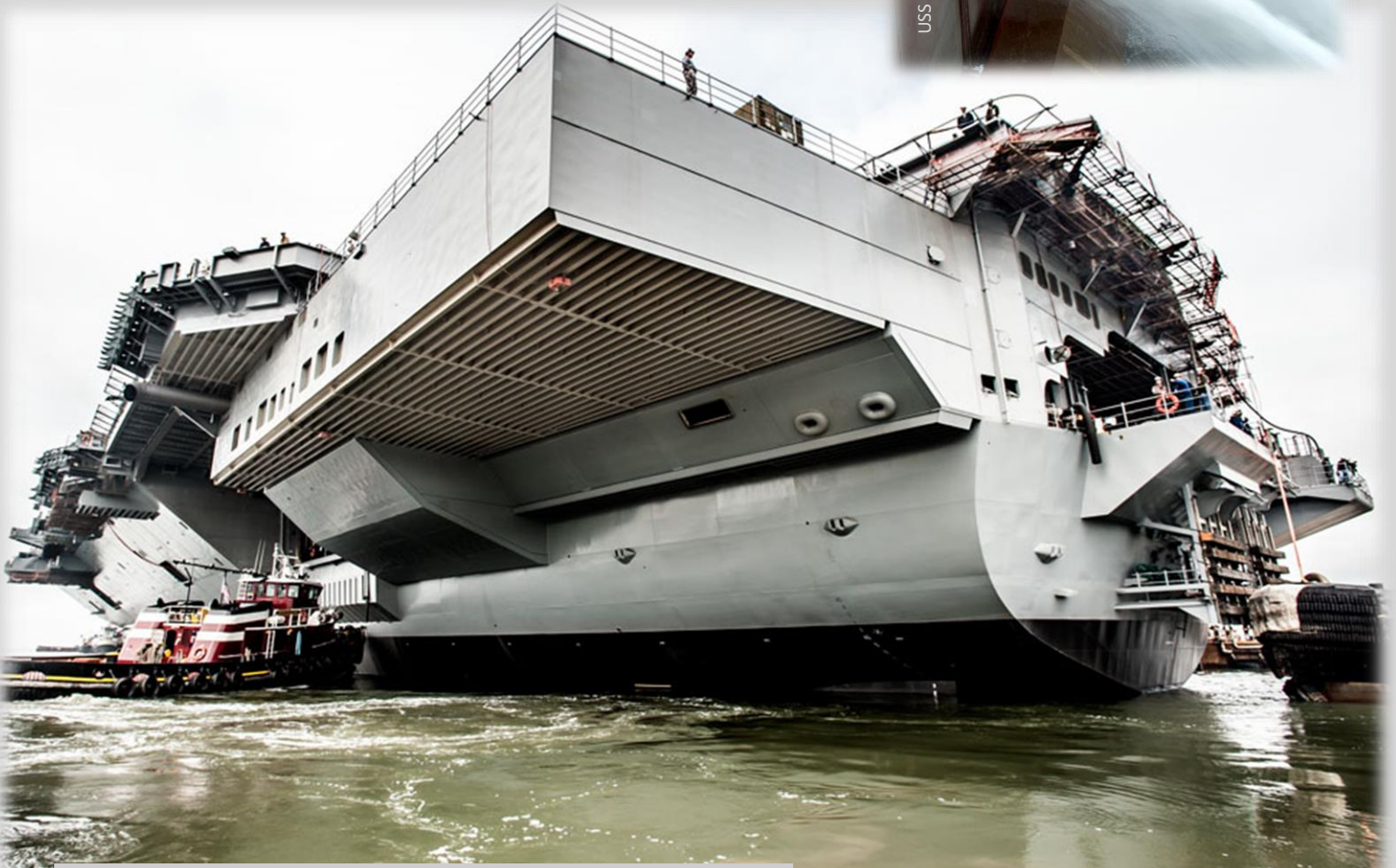
USS GERALD R. FORD (CVN 78) launching from dry dock 12.