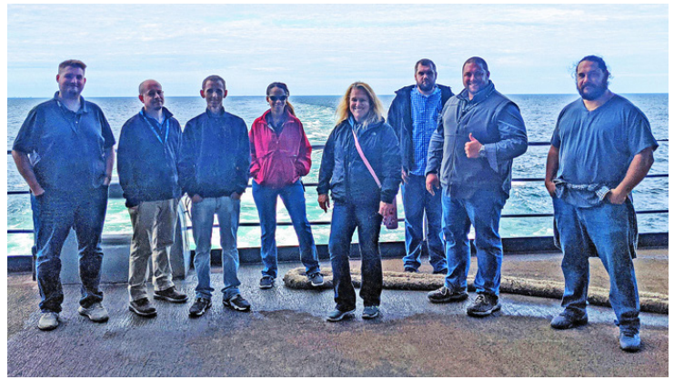
Newport News Shipbuilding employees participated in the Shipbuilders to Sea program in October aboard USS George H.W. Bush (CVN 77).