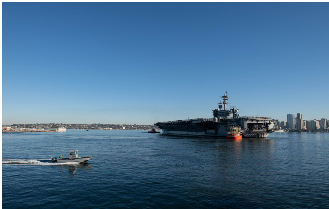
USS Abraham Lincoln (CVN 72) transits San Diego Bay for a regularly scheduled deployment.

For consideration to participate in future trips, contact Renae Myles (E01) via email.