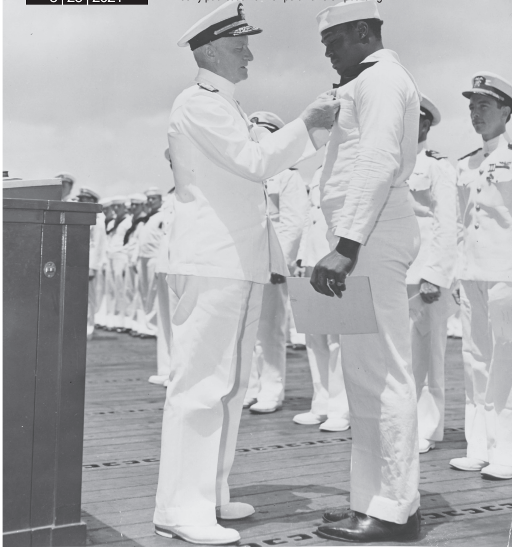
Adm. Chester Nimitz pins the Navy Cross on Doris Miller on Enterprise (CV 6) in 1942.

A weekly publication of Newport News Shipbuilding