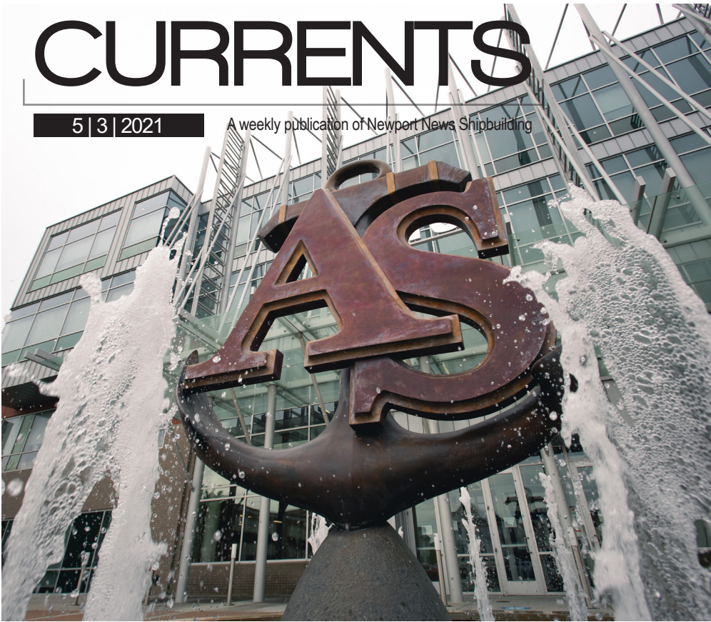
The Apprentice School will begin granting associate degrees in 2023.

A weekly publication of Newport News Shipbuilding