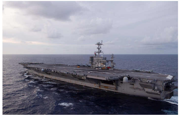
USS John C. Stennis (CVN 74), is shown transiting the Atlantic Ocean in 2019. The ship is expected to arrive at Newport News Shipbuilding for its refueling and complex overhaul later this year.

"With a workforce that is new to the shipbuilding industry, the