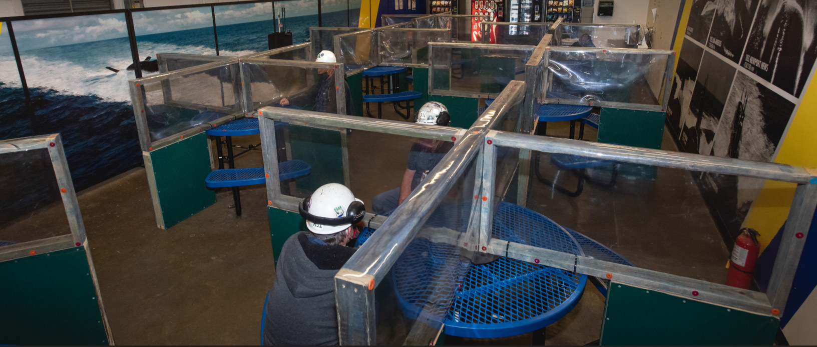
Shipbuilders recently built and installed dividers that allow fellow employees to safely socialize in The Dive without reducing seating capacity.