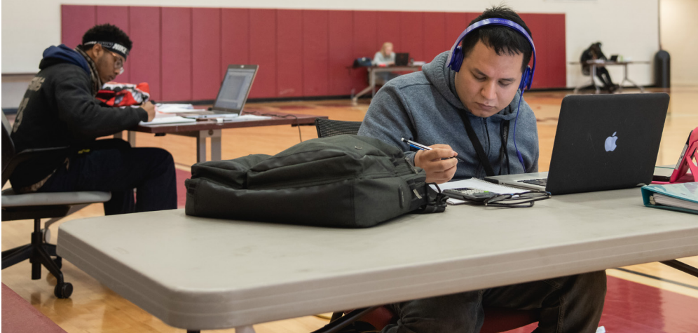
Apprentices maintain social distance while taking online classes in The Apprentice School gym.

A publication of Newport News Shipbuilding