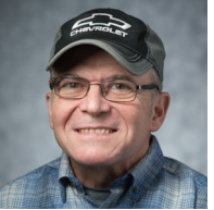
Jimmy Carter 40 years