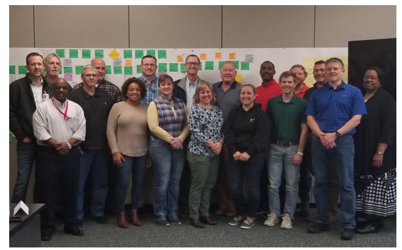
A recent Kaizen event identified more than 25 action items to increase efficiency.

Inspection report (IR) protocol was a priority for the team, which agreed that increased communication regarding IR relationships and schedules is required. The team is implementing actions to address IR quality revision deficiencies, IR tracking and numbering, IR revision control procedures, and clarity of