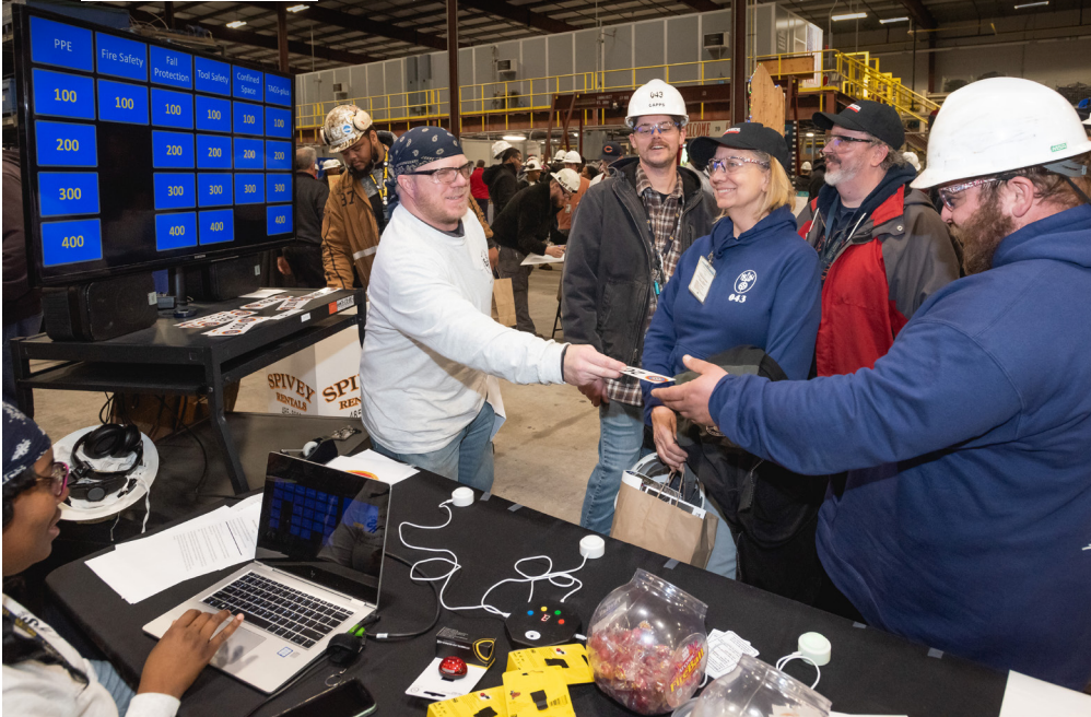
Shipbuilders play a "Jeopardy"-themed safety game at the expo.

A weekly publication of Newport News Shipbuilding