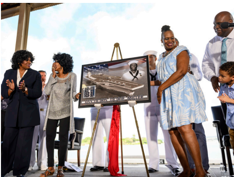
Doris Miller’s relatives unveiled a plaque commemorating CVN 81, the aircraft carrier that will bear his name.