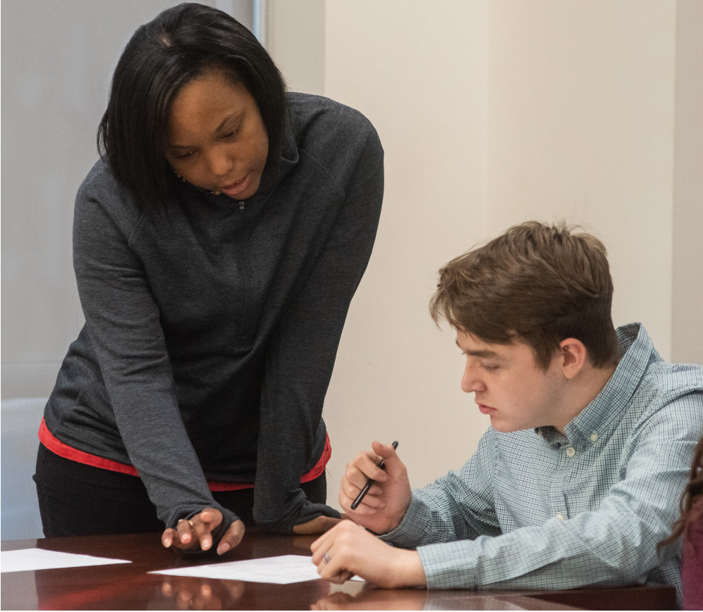
Current apprentices help mentor high school students in the Youth Builders program.

A weekly publication of Newport News Shipbuilding