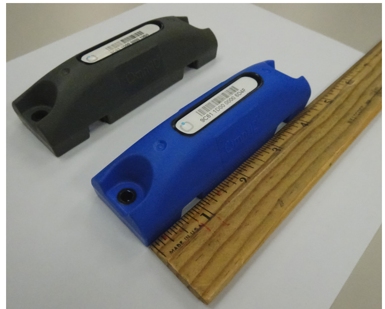
Reusable battery-powered RFID tags are being used to track material that requires preventive maintenance at NNS.

In addition to the tags that are attached directly to material, there are