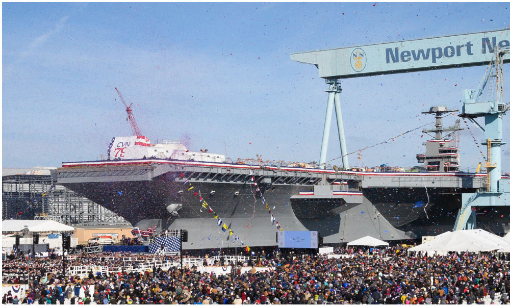
Thousands attended the John F. Kennedy christening ceremony on Dec. 7.