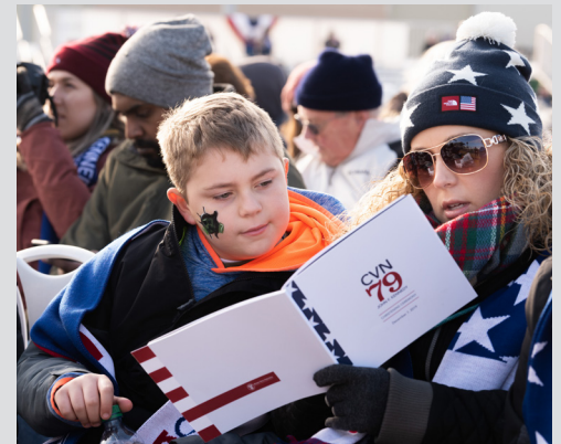
Guests read the John F. Kennedy (CVN 79) christening program.

Since the first cut of steel in February 2011, shipbuilders have worked to construct Kennedy , and suppliers from 46 states across the country have contributed specialized parts, skilled services and support to aircraft carrier production. In the weeks following the christening, the carrier will be launched into the James River and moved to a pier where outfitting and testing of the ship's systems will continue until the ship is delivered to the U.S. Navy in 2022.