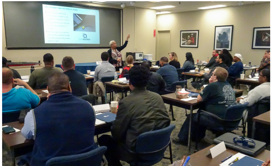
New shipbuilders learn about NNSAccess and YubiKeys during a Nov. 11 employee orientation session.