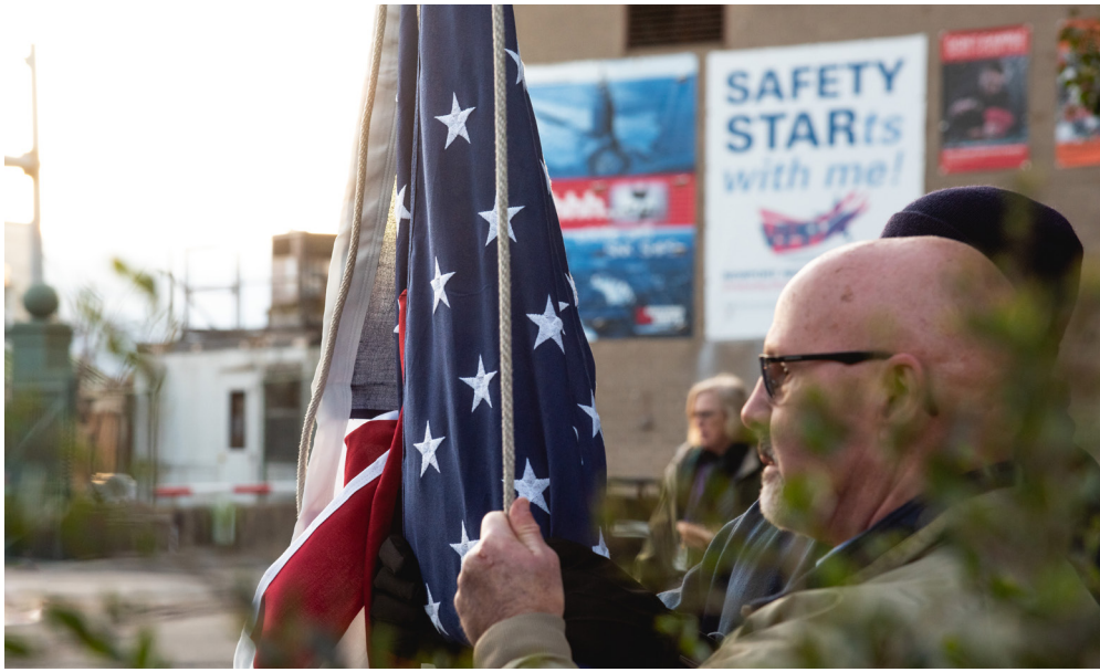
Shipbuilders raise the American flag near the 37th Street gate during a ceremony in honor of veterans.