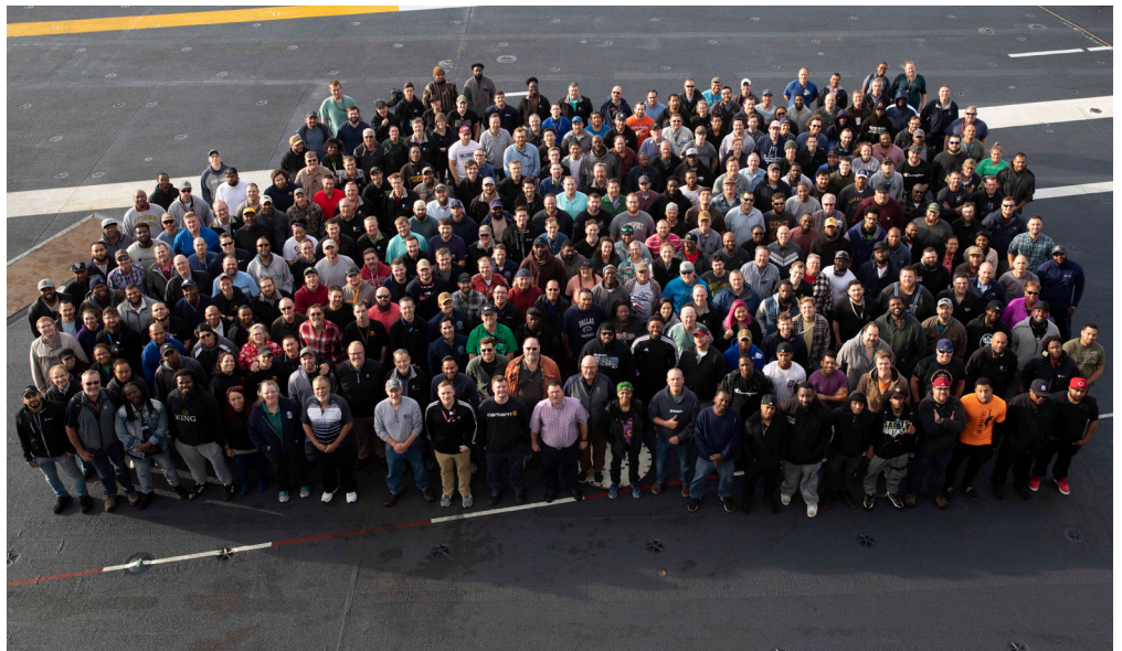
Shipbuilders who participated in USS Gerald R. Ford 's sea trials stand on the flight deck.

A PSA is a typical period of construction availability in the early life of a ship, during which the Navy and shipbuilders resolve issues that arise during initial at-sea periods and make any needed changes and upgrades.