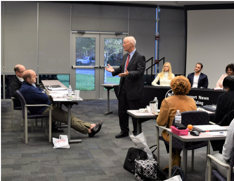
A representative from the U.S. Small Business Administration provided information about resources.

Green sheets for those with existing accounts were phased out earlier this year. For more information, see the NNSAccess website on MyNNS.