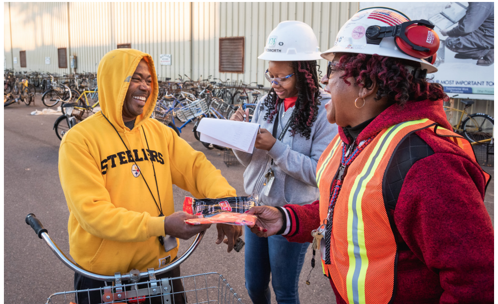
Shipbuilders from Waterfront Support Services and Environmental Health and Safety handed out reflective vests to bicycle riders as they entered the gates on Nov. 4.