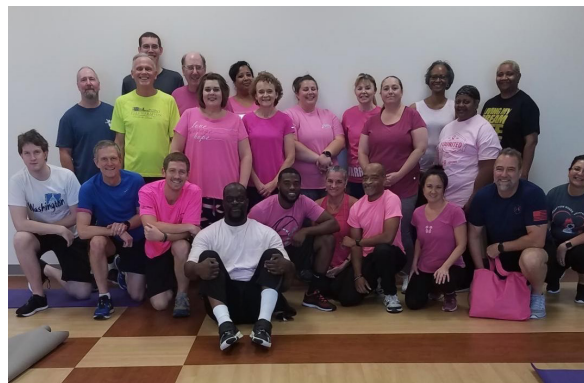
Group fitness class attendees recognized Breast Cancer Awareness Month during a class in October.