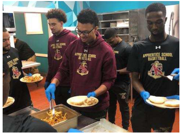
The Apprentice School men's basketball team recently served meals at the Peninsula Rescue Mission.

"The guys know that homelessness is a reality, but I wanted them to personally interact with these guys and serve them," he said. "Some of the men we were serving told us they made one big mistake or bad decision in their life, and it's caused them to be homeless. It was good for my guys to hear that, because decisions are important and can really impact your life."