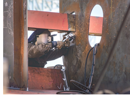
A shipbuilder grinds on an Enterprise (CVN 80) unit located on Platen 21.