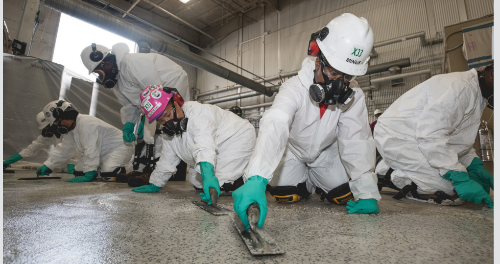
Shipbuilders work to restore the floor in "Applebee's" in August.

An American flag hangs from one of the beams in the middle of the room. Banners on the wall show all Navy ships that have undergone refueling and complex overhaul (RCOH) at NNS.