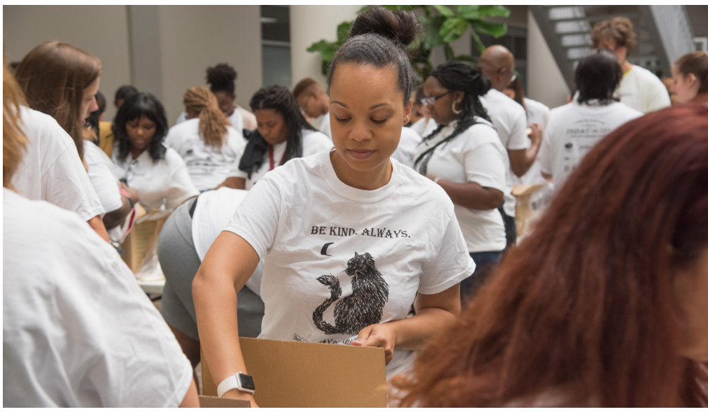
Shipbuilders and family and friends pack kits for survivors of sexual violence.

"The Day of Caring gives us opportunities to volunteer in our community when it is needed most and affords us the chance to strengthen ties in our community. It also allows us to create new friendships and