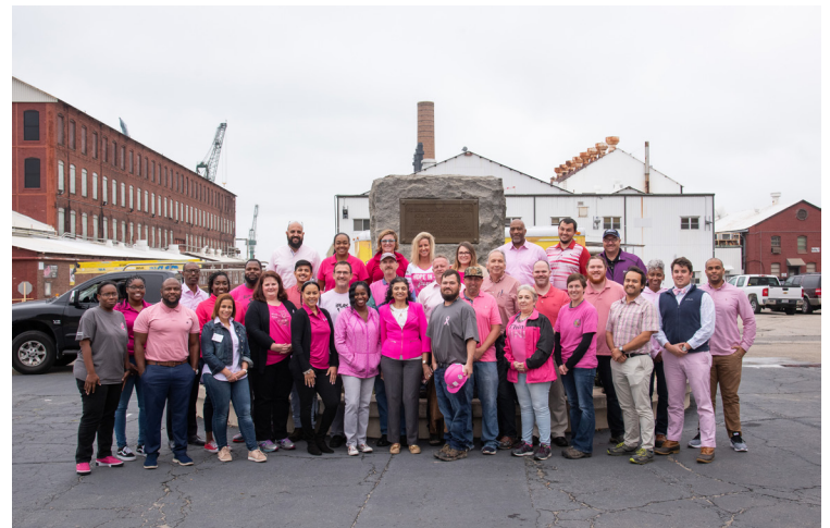
Members of Women in Shipbuilding Enterprise (WiSE), left, and employees from several Quality departments, right, gathered to raise awareness of breast cancer.