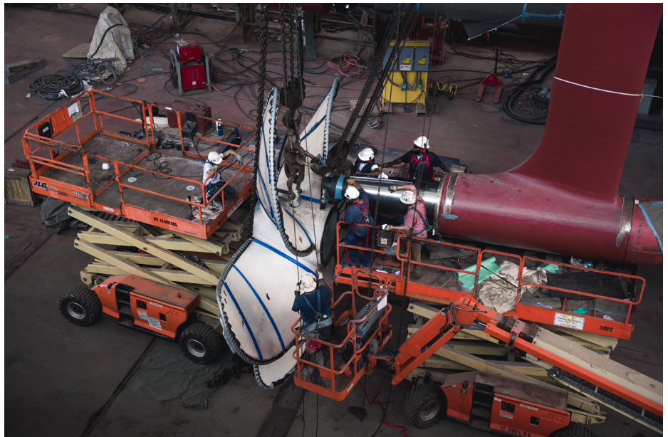
Shipbuilders install one of CVN 79's propellers.

“The process we had to go through to get to this point is amazing. It looks like it would be a quick and easy job. But in reality, there are so many