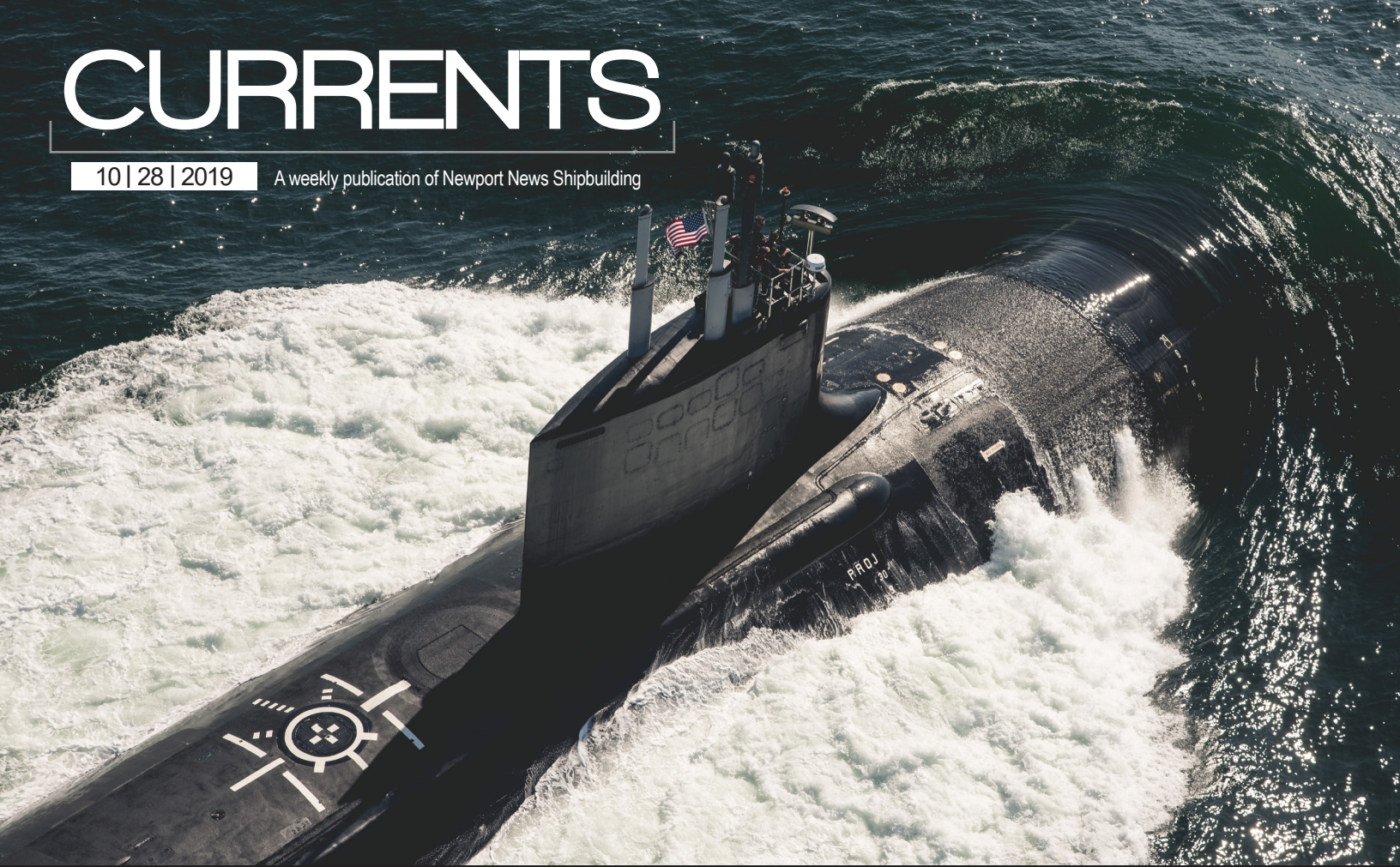
Delaware (SSN 791) is the 18th Virginia-class submarine.

A weekly publication of Newport News Shipbuilding