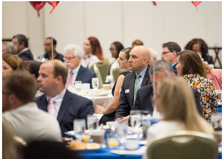
More than 200 community leaders including NNS representatives attended the kick off event.

This year’s goal is set at $5.5 million, an effort to exceed the 2019 goal that totaled $5 million. NNS' 2020 United Way campaign will begin in February. Additional information will be published in future editions of Currents and in NNS employee communication channels. Send questions to UnitedWay@hii-nns.com .