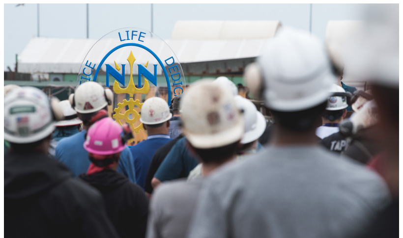
Shipbuilders attend the Workers' Memorial Day ceremony in the North Yard.