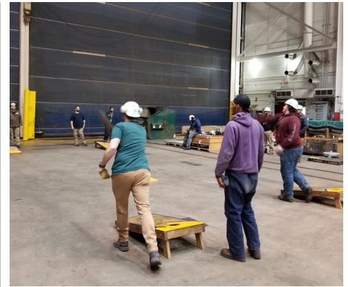
Virginia Class Submarine Program shipbuilders participate in a cornhole tournament.

Habitat for Humanity has waiver requirements and a construction safety policy and plan. Volunteers are required to read the safety plan each week and sign a waiver to participate at the job site. To sign up to volunteer, or to learn more, email HforH_Volunteer@hii-nns.com .