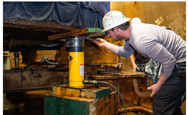
Newport News Shipbuilding employees recently installed new support stands for USS Monitor 's turret.

Shipbuilders replaced eight pedestal support stands to give conservators full access to all sides of the iconic artifact and reveal its roof's exterior for the first time since the ship sank in the Atlantic Ocean during a storm in December 1862.