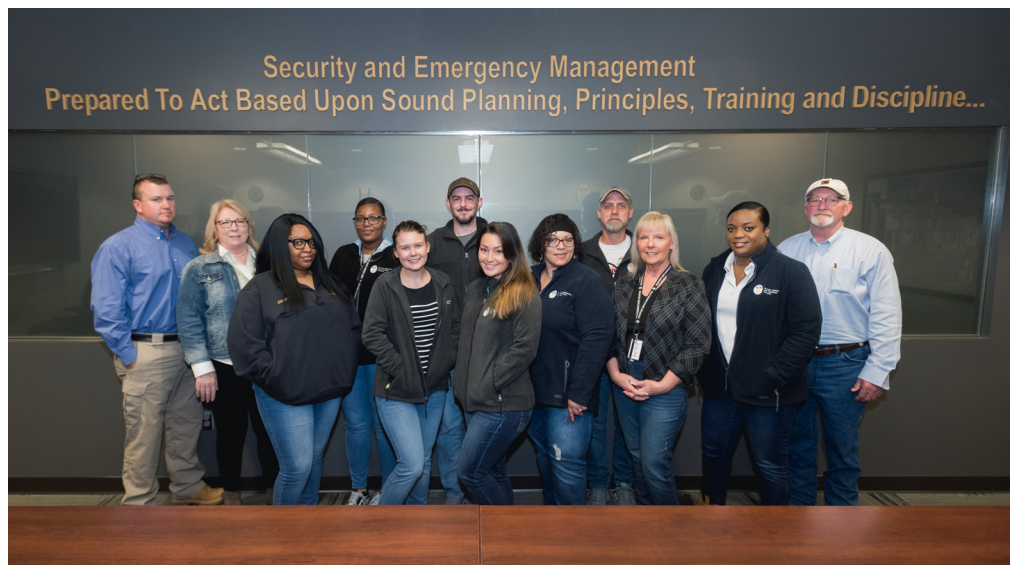
Newport News Shipbuilding is recognizing its emergency communications technicians this week.

Visit www.myalex.com/hii/2019/hiibenefits to access ALEX. Shipbuilders also are invited to attend annual enrollment fairs this week to learn about benefit options, talk with 401(k) representatives and review the Tobacco Free Incentive Program. See the April 8 edition of Currents for details.