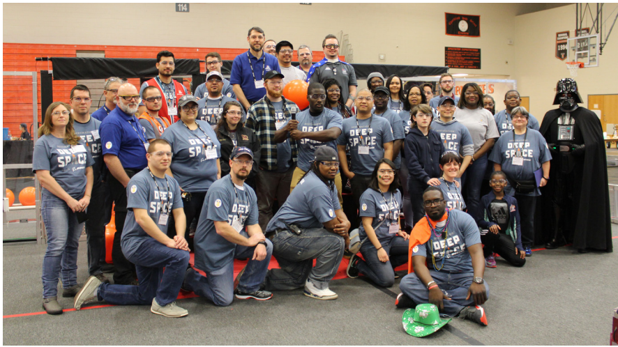
About 50 Newport News Shipbuilding employees volunteered at the FIRST Robotics Chesapeake District Hampton Roads Competition.