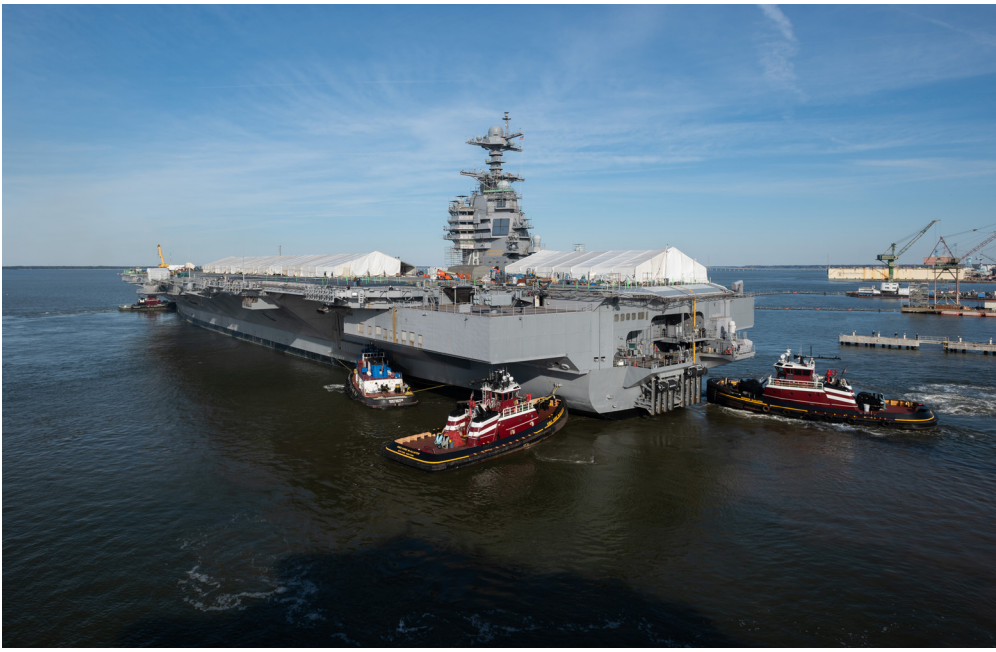
Shipbuilders completed a turn-ship evolution for USS Gerald R. Ford (CVN 78) in March.