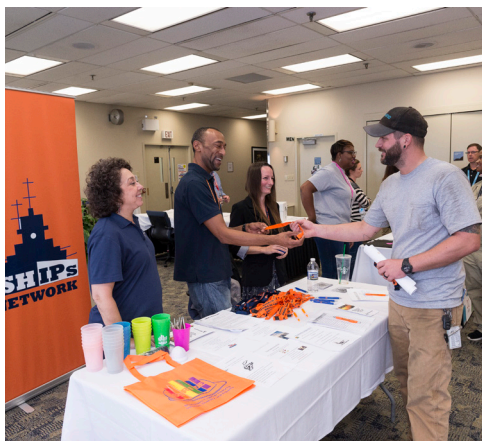
Newport News Shipbuilding's employee resource groups will participate in the "Enable Our Workforce" Expo March 19 in Bldg. 520.

Technology access may vary and help is first come, first served. Look for additional communications on future clinic dates for UPoint and tobacco status support.