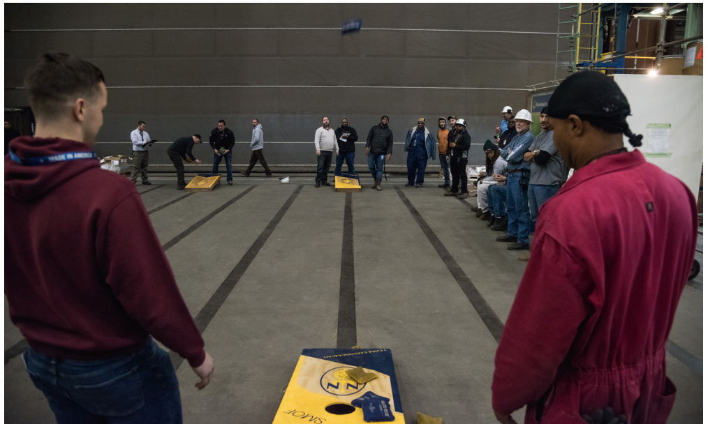
Shipbuilders participate in the VCS cornhole tournament.

If a user loses, damages or forgets their YubiKey, they should call the Service Desk at 688-HELP. For more information, visit the multi-factor authentication (MFA) website on MyNNS.