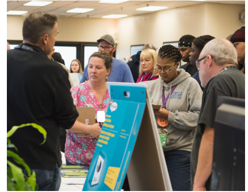
The "Enable the Workforce" expo is open to all employees.

Thank you in advance for your cooperation.