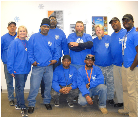
Shipbuilders who work in the scrapyard, left, and in warehouses along Warwick Boulevard show off their team T-shirts.

There are currently 26 Columbia detail groups loaded in SAP consisting primarily of structural and piping work. These will turn into as many or more digital work packages to support advanced construction start in June.