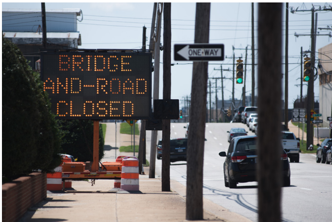
Huntington Avenue is shown just before the bridge replacement project began last summer.