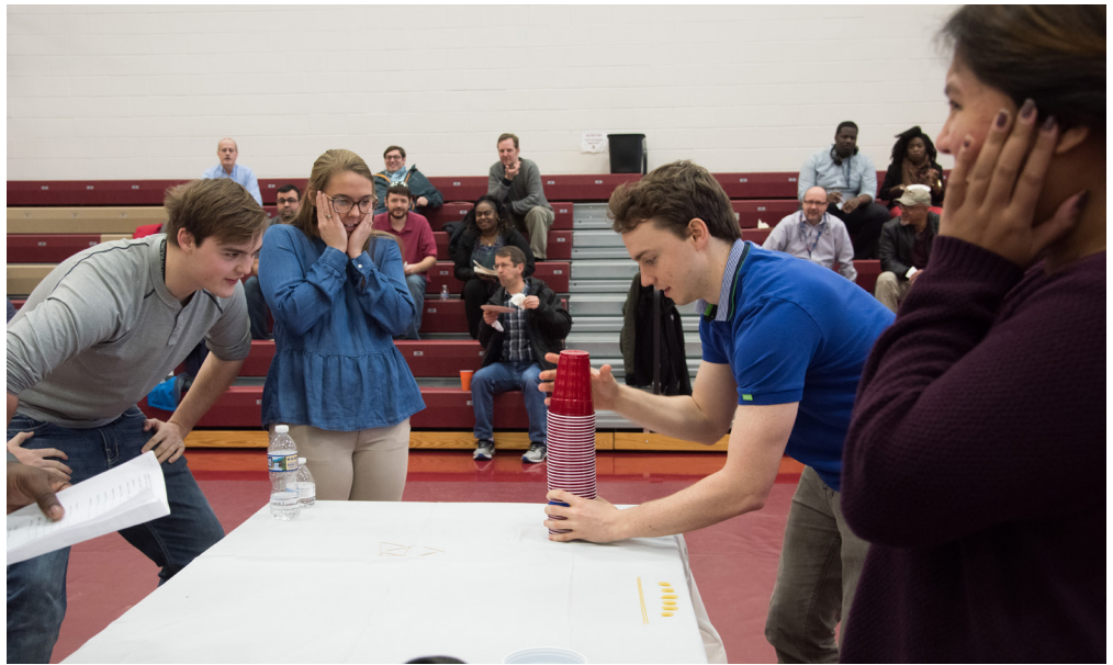
A team of shipbuilders competes for the grand championship at the final tournament for Design and Engineering Appreciation Week.