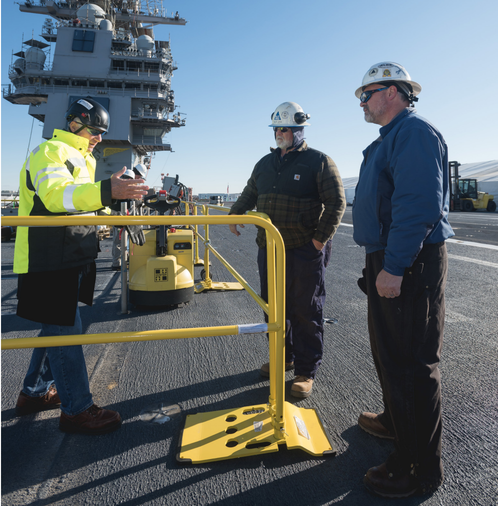
New portable guardrails are set up on the flight deck of USS Gerald R. Ford (CVN 78).

A weekly publication of Newport News Shipbuilding