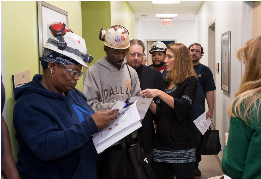
Shipbuilders attend the S3 - Shipbuilders Stop Smoking kickoff at the HII Family Health Center last October.

Shipbuilders who have been tobacco-free for six months or have successfully completed a tobacco cessation program can declare themselves “tobacco-free” through UPoint on www.hiibenefits.com and save $660 on their annual medical premium. Shipbuilders who don’t remember their UPoint password should call the HIBC at 1-877-216-3222 before annual enrollment begins.