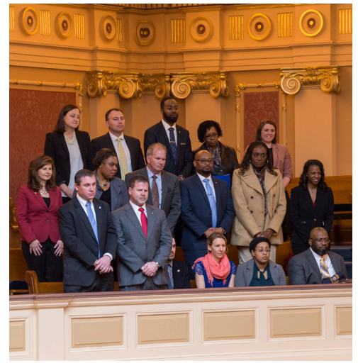
Representatives from Newport News Shipbuilding are recognized during a House of Delegates session on Wednesday, Feb. 13.