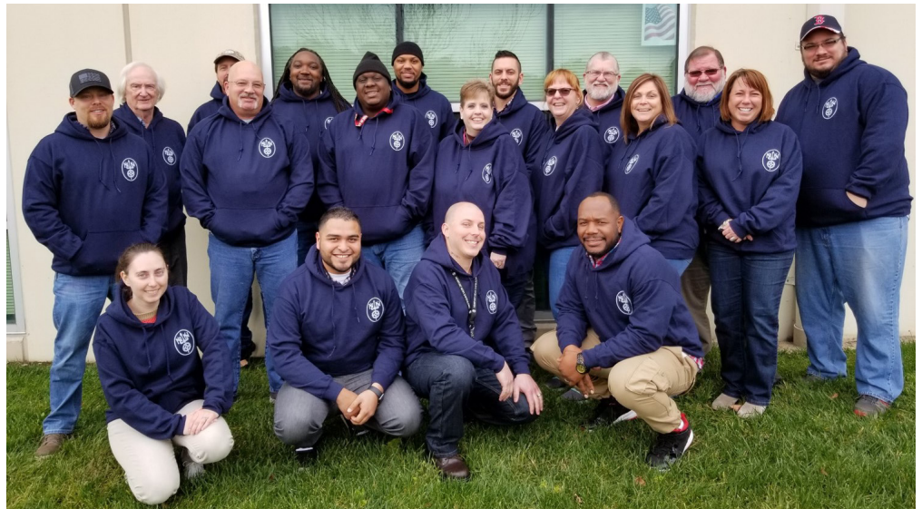
Shipbuilders model their new hoodies. The backs of the hoodies feature the new Quality Control logo and vision.

The new aspirational vision defines what Quality Control is about and embodies the