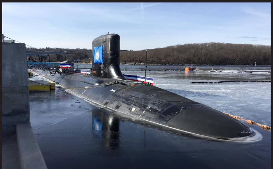
USS South Dakota (SSN 790) was commissioned Saturday, Feb. 2, in Connecticut.