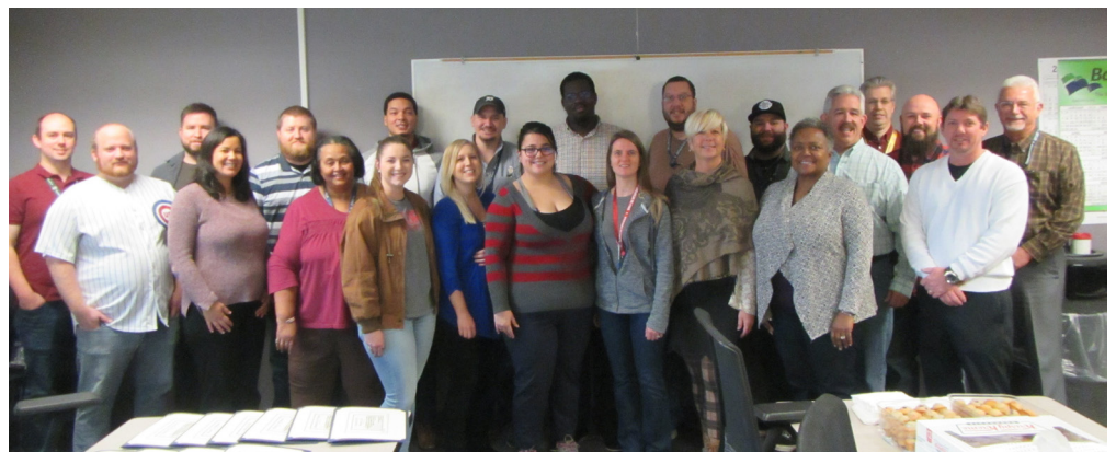
A team of shipbuilders was recognized for helping to hire more than 250 entry-level designers at NNS in a 26-month period.

During the events, candidates were taken on a windshield tour and exposed to the graphic tools they would use if they were hired. The team used a post-interview discovery session