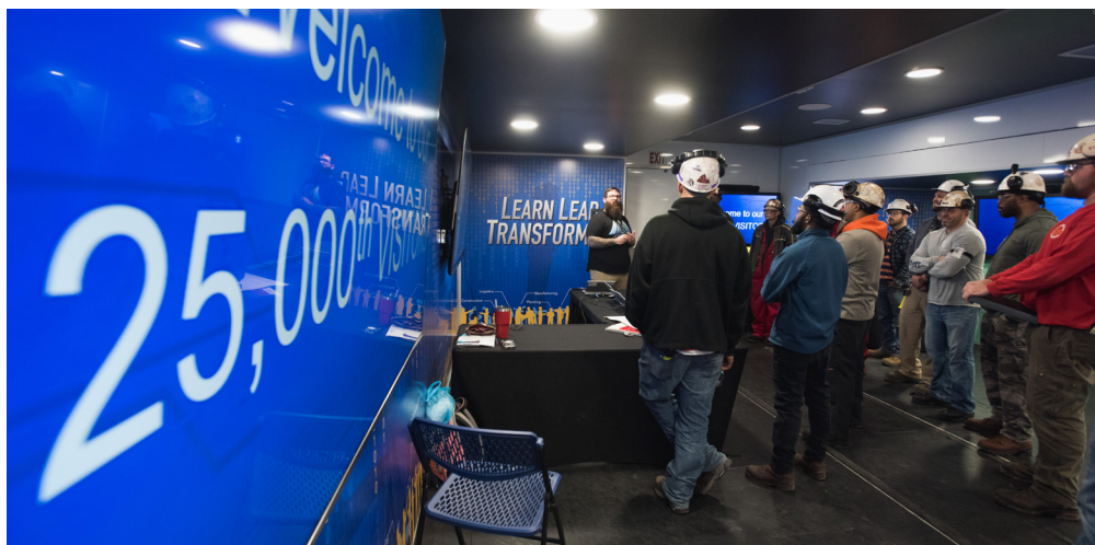
The group of shipbuilders that included the 25,000th visitor to Newport News Shipbuilding's MX trailer participates in a tour.