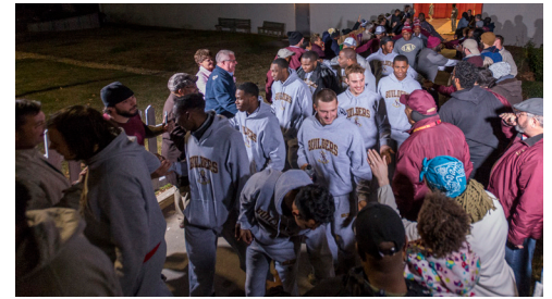
Supporters gathered to see the Builders off before the team's national championship victory.

Volunteers also are needed to manage water stations, help with packet pick up and cheer along the course. To sign up for races or volunteer opportunities, visit www.onecitymarathon.com .