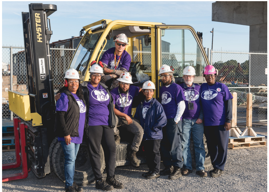
Shipbuilders like those who work in and around Bldg. 505 take pride in keeping their work areas clean and neat.

In addition to safety, Jonathan Temple (O53) said there are other advantages – like schedule adherence – to keeping workspaces clean and