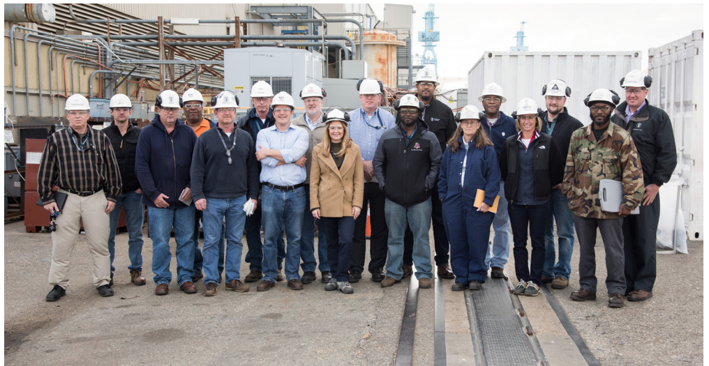
Members of the Quality Control Leadership team recently set out to reinforce good safety habits.

For questions about the program, contact Sultan Camp (K21) at 688-0913.