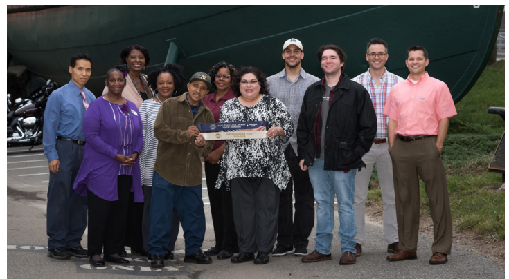
Members of the Spear and Gear Toastmasters Club celebrate being named a distinguished club by Toastmasters International.

Visit www.tasfd.org to learn more, apply for a scholarship or donate.