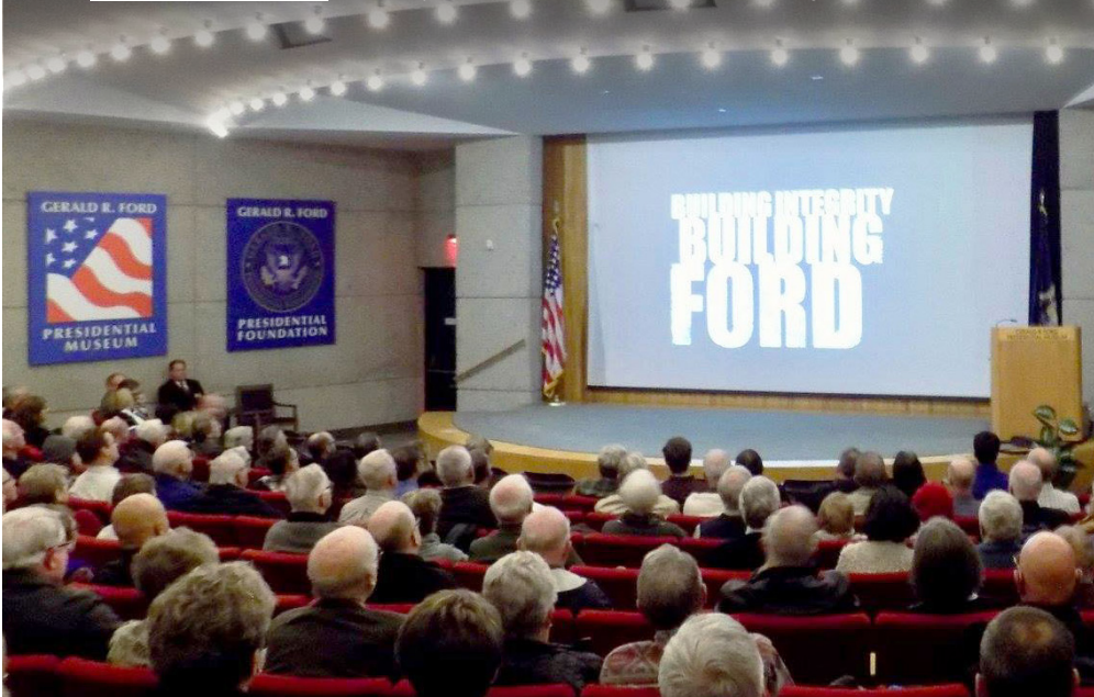
People gather at the Gerald R. Ford Presidential Museum for a special screening of the Newport News Shipbuilding-produced documentary "Building Integrity, Building Ford."

A weekly publication of Newport News Shipbuilding