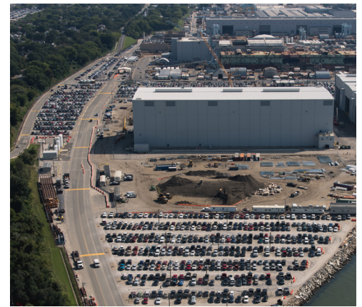
Newport News Shipbuilding will soon relocate some parking spaces in the North Yard to make room for Joint Manufacturing and Assembly Facility (JMAF) construction.