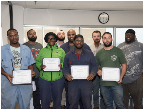
In-Service Aircraft Carrier Program Engagement Champions were recently recognized for their efforts with a certificate and a coin.