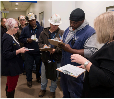
Shipbuilders attend the kickoff event for the S3 Program.