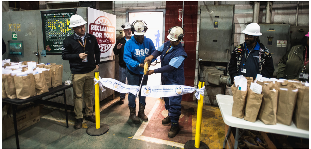
Shipbuilders cut a ribbon to mark the opening of a new break room in the Ring Module Shop.