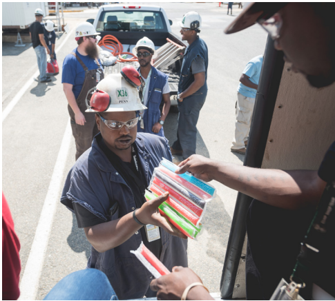
CVN 79 engagement champions hand out ice pops to shipbuilders in the CVN 79 program.