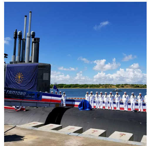
USS Indiana (SSN 789) was commissioned Saturday, Sept. 29, in Florida.

More than 3,000 shipbuilders and 2,000 suppliers from across the country are supporting the construction of Kennedy . The christening is planned for late 2019. Watch a video of the lower bow superlift on MyNNS or the NNS to Go app.