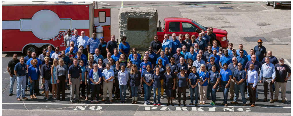
Shipbuilders gathered at The Rock to celebrate the first Newport News Day.

Indiana – built at NNS and General Dynamics Electric Boat – was christened at NNS in April 2017.