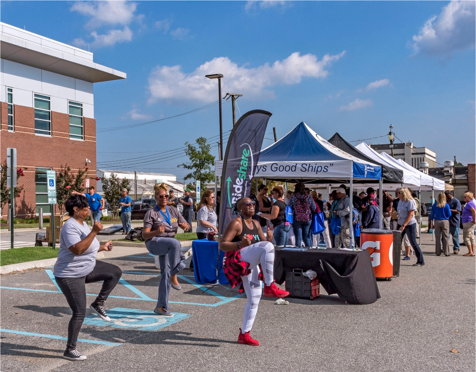
Shipbuilders participate in a recent Fun at the Park event in the parking lot of the HII Family Health Center. Another event is planned for Oct. 17.

Grady White - 226 Seafarer with a 200HP Yamaha engine with trailer. Many extras. Excellent condition. $20,000. (757) 652-8919