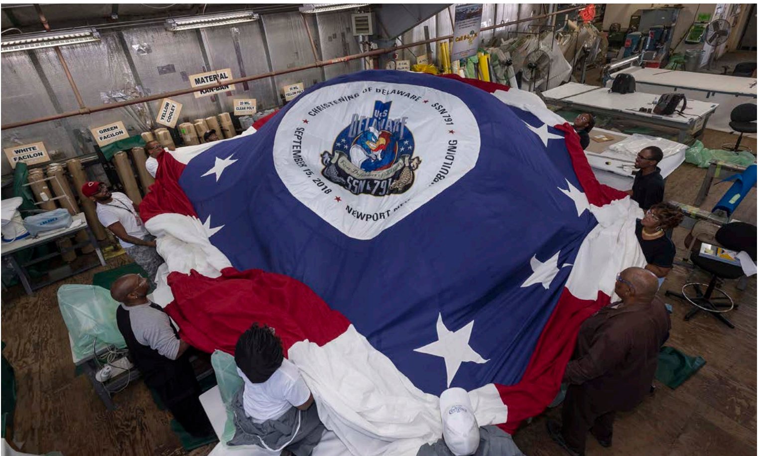
Shipbuilders in the Sail Loft Shop prepare the bow flag for Delaware (SSN 791).

Bowflex Max Trainer - The M5 is a low impact high intensity exercise machine. $800. Text (804) 298-6515