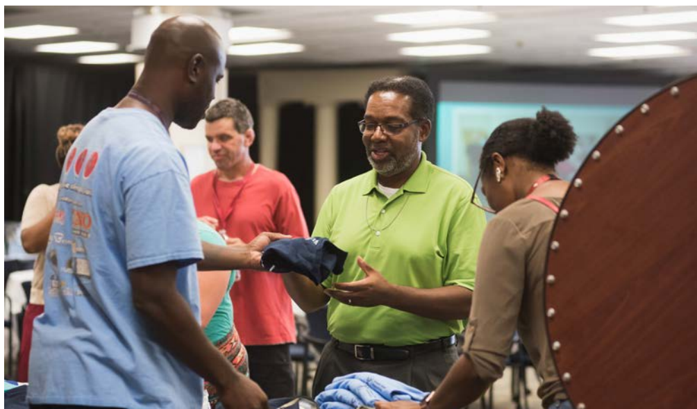
SEEKnn's volunteers had the opportunity to win prizes during a recognition ceremony last week.