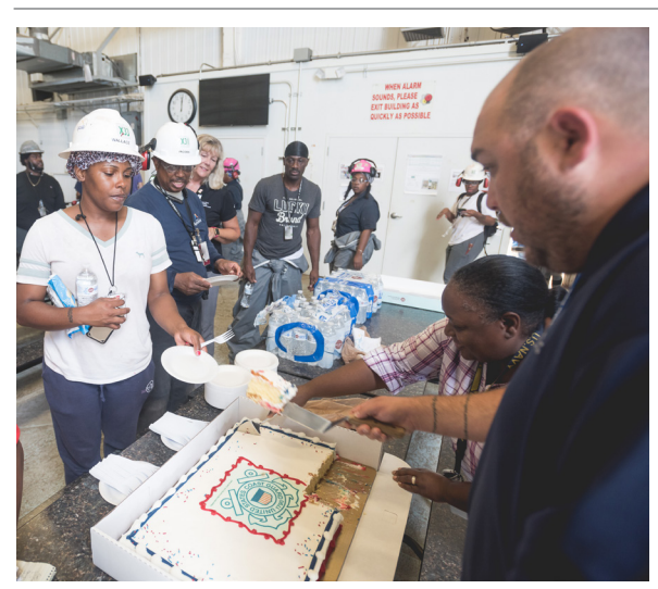
Shipbuilders celebrate the Coast Guard's birthday with a cake in Applebee's (Bldg. 227) Friday, Aug. 3.