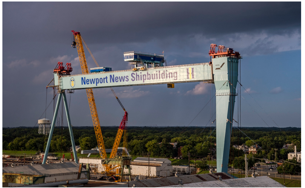
The girders of Newport News Shipbuilding's new 315-metric-ton Goliath gantry crane were lifted into place Aug. 4-5.