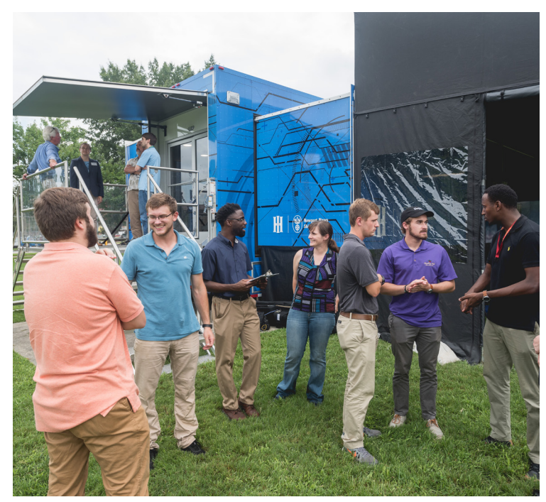
Newport News Shipbuilding's Mobile Experience trailer spent two days at Norfolk Naval Shipyard last week.