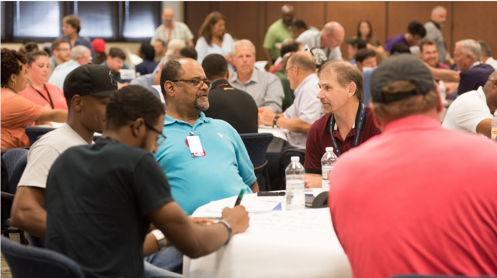
Shipbuilders attend a kick-off event for the Operations Division's new Engagement Champion Program.