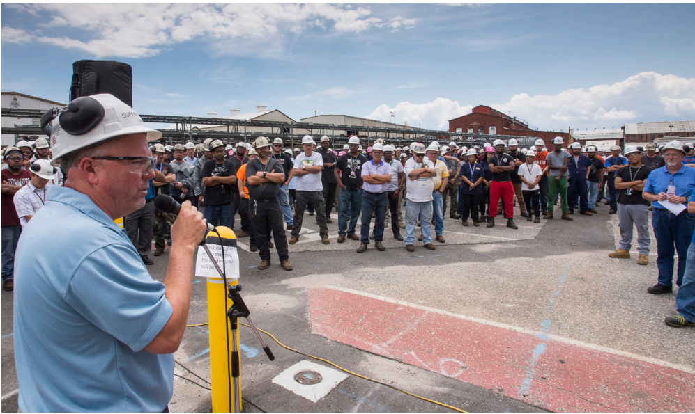
Shipbuilders attend a stand-down meeting outside of Bldg. 160.