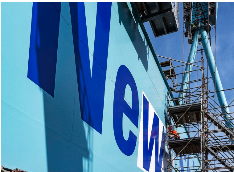
The final letters are painted on Newport News Shipbuilding's new 315-metric-ton Goliath gantry crane.

Puppies - 2 purebred female Rottweiler puppies for sale. 8 weeks old. First set of shots done. Serious Inquires. (757) 633-0417