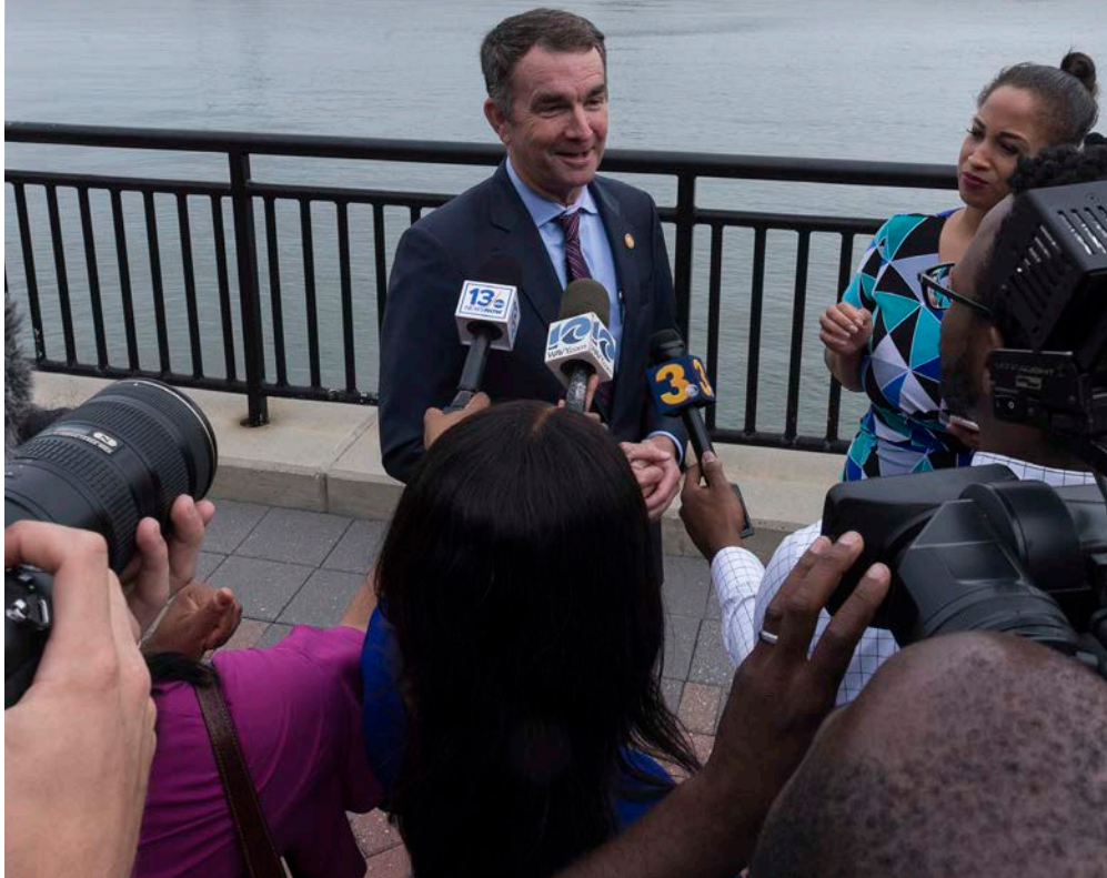
Virginia Gov. Ralph Northam talks to the media after announcing the state hiring partnership with Newport News Shipbuilding.

A weekly publication of Newport News Shipbuilding