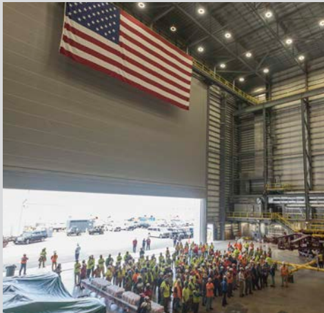
Shipbuilders and contractors attend the flag dedication ceremony in the Joint Manufacturing and Assembly Facility.