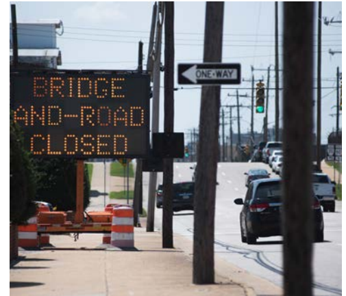
The section of Huntington Avenue between 39th and 42nd streets is expected to be closed for about one year.

See insert for the full list of nominees.