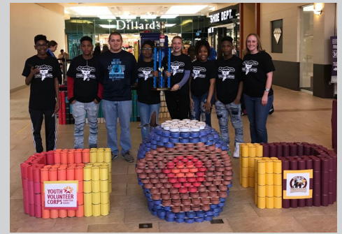
Warwick High School won the high school division of this year's can-structure competition.