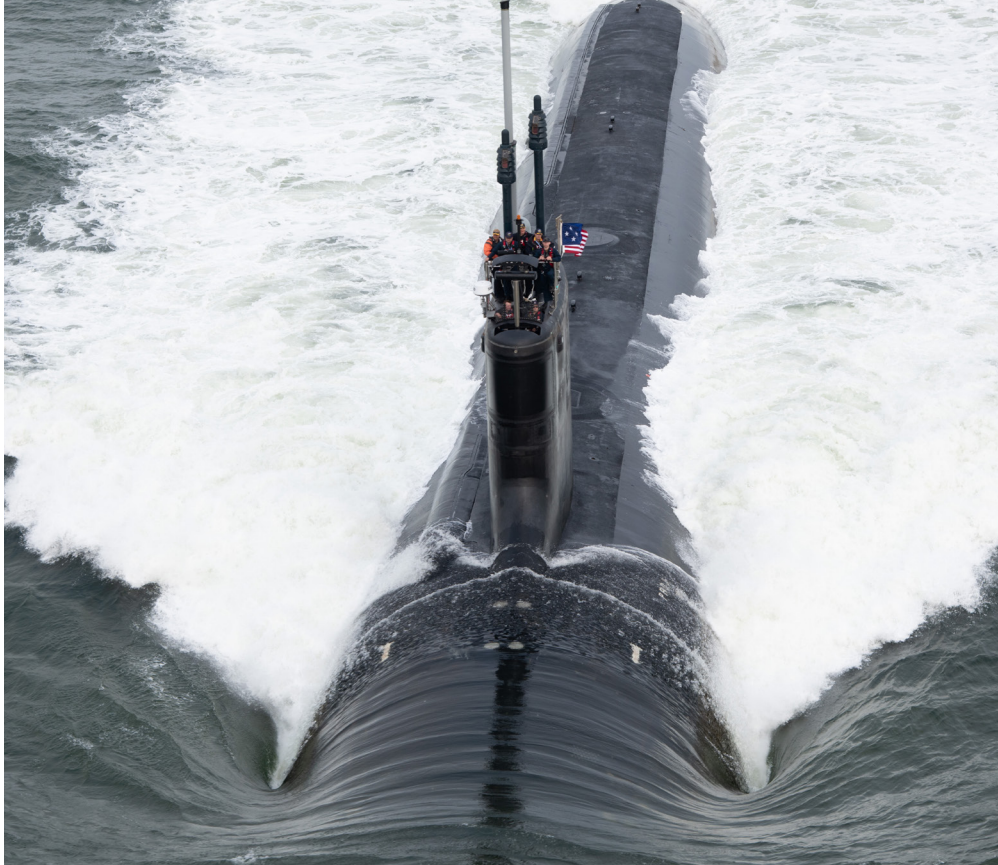
Indiana (SSN 789) is shown during sea trials in May.

A weekly publication of Newport News Shipbuilding