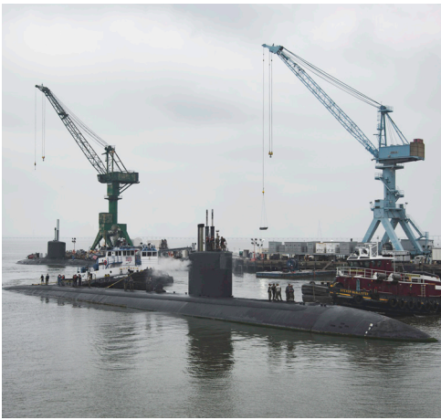
USS Boise (SSN 764) arrives at Newport News Shipbuilding to begin its 25-month extended engineering overhaul.