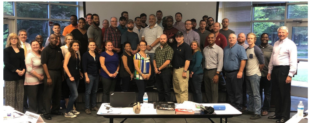
More than 40 shipbuilders participated in a Lean Leaders Champions Training workshop June 13-14.

As a reminder, information about parking and transportation services is available at nns.huntingtoningalls.com/parking-transportation and within NNS to Go, which is also available in both the Google Play and Apple app stores. For the best user experience, please ensure your device is using the latest version of the mobile operating system.