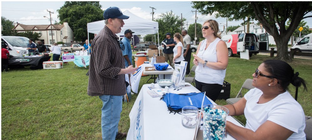
Employees learn about services available to them during the "Fun at the Park" event.

In the coming weeks, a fourth parking resource – the NNXPRESS app – will also be available to employees. This app will track company shuttles and taxis in real time. Additional information about NNXPRESS will be communicated via company communication channels.