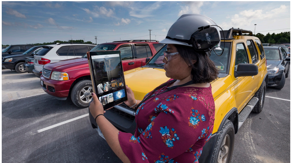
A shipbulder looks at the new parking/transportation website.

NNS to Go is available for free download in the Google Play and Apple App stores by