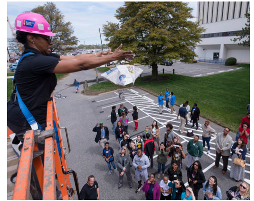
Students from across the Peninsula gathered at Newport News Shipbuilding for Career Pathways' Egg Drop Competition.

"It was awe inspiring. The students had logical thoughts defining career readiness