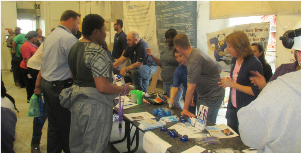
Shipbuilders learn about employee resource groups at NNS during an ERG Mini Expo.