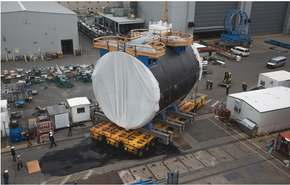
A Reactor Compartment Forward (RCF) module is moved from the Modular Outfitting Facility (MOF) to a waiting sea shuttle.