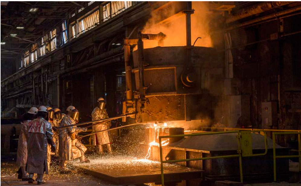
The Foundry team begins the pour for a John F. Kennedy (CVN79) steel elevator guide rail.