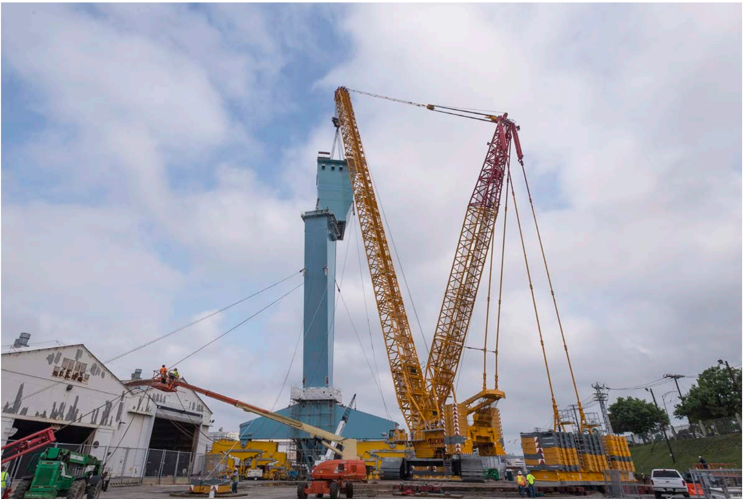
Crews conduct a lift of more than 300 tons to top off the south leg of Newport News Shipbuilding's new 315-metric-ton Goliath gantry crane.

Huge Yard Sale - 8 a.m. - 1 p.m., Sat., June 2. Forest Lakes (Chesapeake). All proceeds go to Cystic Fibrosis Foundation. (434) 851-2445