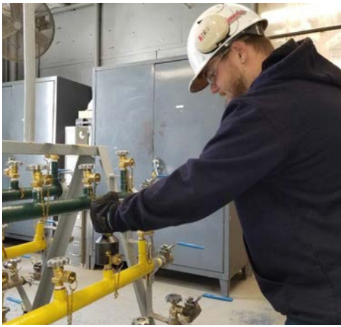
A shipbuilder uses a new T-handle device.