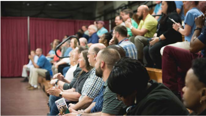
Many shipbuilders attended an alumni reception earlier this month in honor of Thomas Nelson Community College's 50th anniversary.