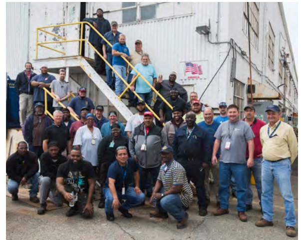
The X36 Tool Repair Team was recently honored for submitting more safety improvements than any other X36 team in 2017.