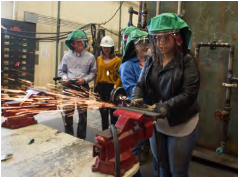
"Bring Your Daughter to Work Day" participants took part in a number of hands-on activities.