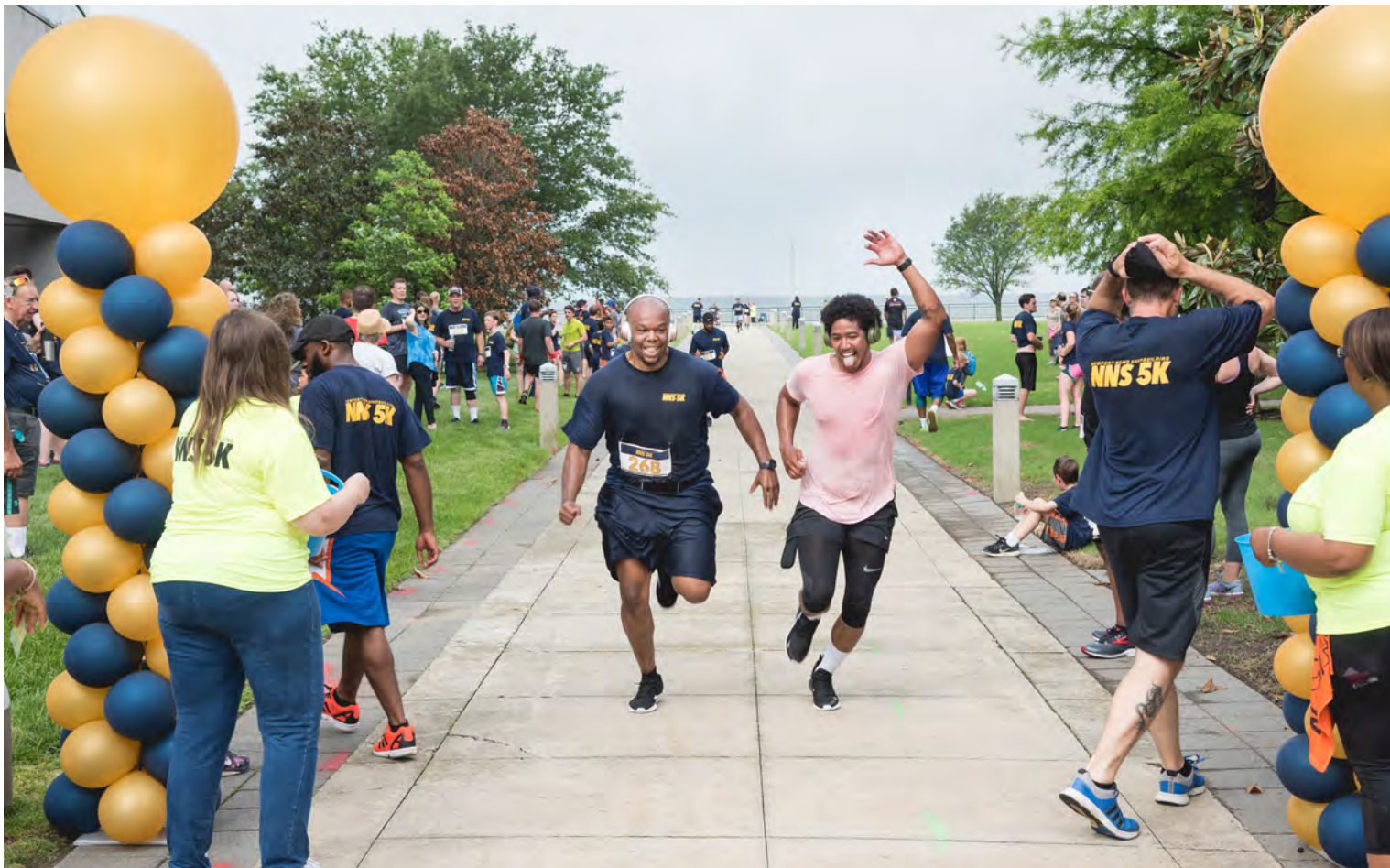
Shipbuilders, family and friends took part in the 11th annual NNS 5K Saturday.

2 Bird Cages - Large cage, $150 OBO. Medium cage, $80 OBO. Assembled. Call for pics & dimensions, leave message. (757) 409-8200