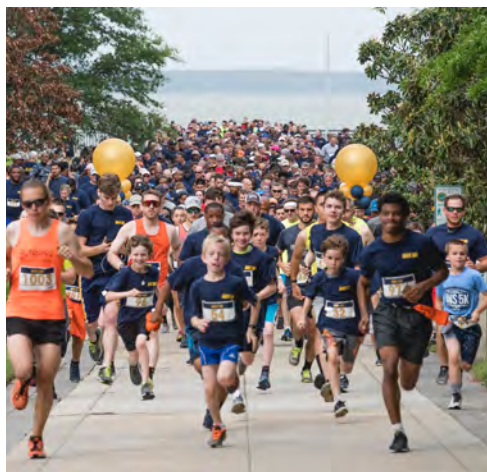
Shipbuilders, family and friends took part in the 11th annual NNS 5K Saturday.