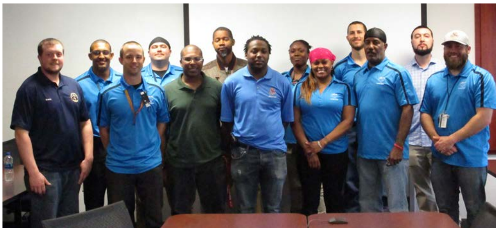
Members of the CVN 73 Waterfront Leadership Engagement Team (WLET) recently honored shipbuilders for modeling engagement and leadership.

In appreciation for their efforts, the WLET presented each shipbuilder with a certificate,