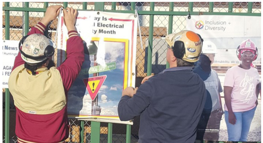
The Electrical Department (X31) placed banners around NNS to raise awareness about electrical safety.

On average, there are more than 300 deaths and 4,000 injuries across the nation each year from contact with an electrical energy source. There are more than 2,500 children treated from wall outlet accidents each year. These numbers don't include countless near misses that aren't reported, according to Reams.