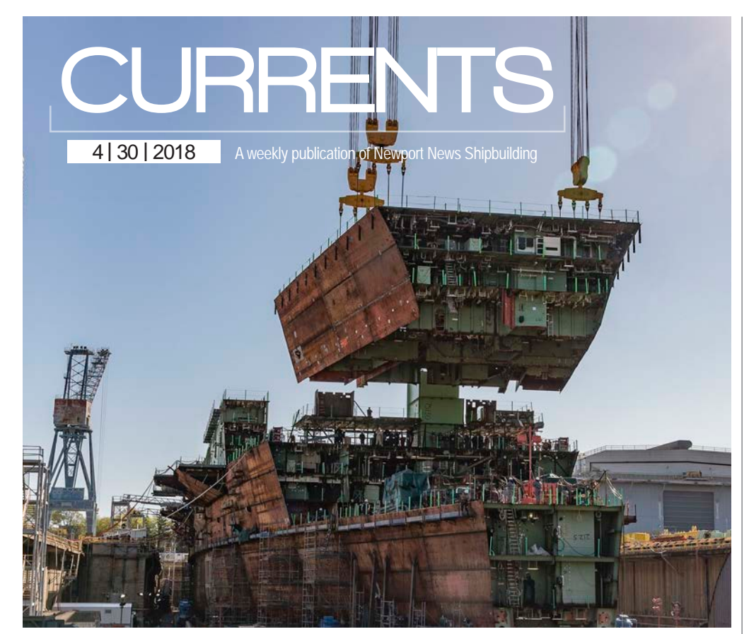
Shipbuilders install a 750-metric-ton forward section of Kennedy's main deck.