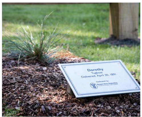
A longleaf pine planted at The Mariners' Museum is named for Dorothy , Newport News Shipbuilding's first hull.