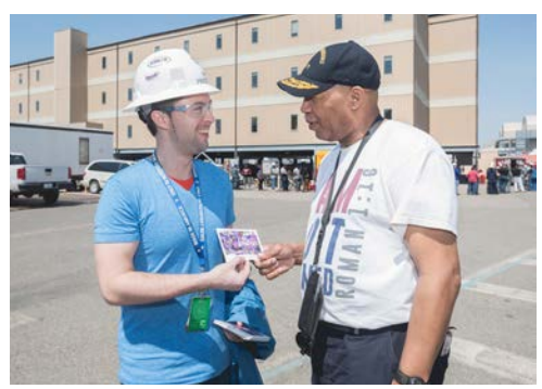
Shipbuilders spread the word about Relay For Life during lunch.