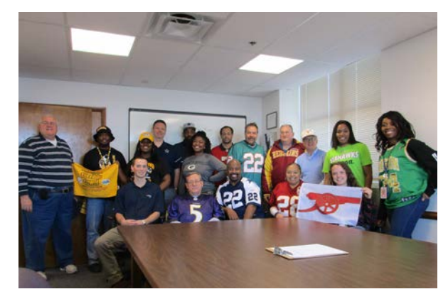
Shipbuilders celebrate "Team Tuesday."