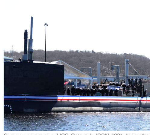
Crew members man USS Colorado (SSN 788) during the commissioning ceremony.

Panelists covered a variety of topics, including the gender gap in STEM career fields and the importance of hard work, taking advantage of available resources, finding mentors and building positive relationships.