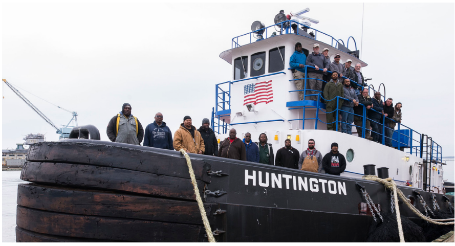
Some of the shipbuilders who braved rough conditions to protect shipyard and Navy assests during a recent nor'easter stand on the tugboat Huntington .

The tugboat Huntington was brought alongside a ship moored at Pier 6 to help smooth out the motion caused by the rough seas.