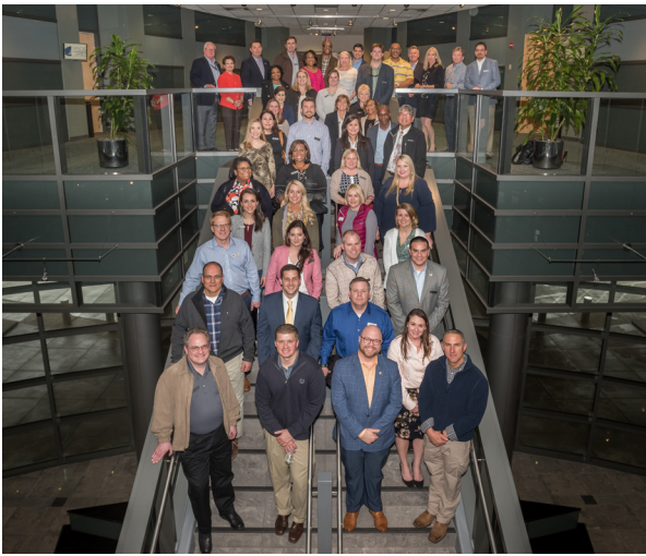
Members of the 2018 LEAD Hampton Roads class visited NNS Feb. 15.