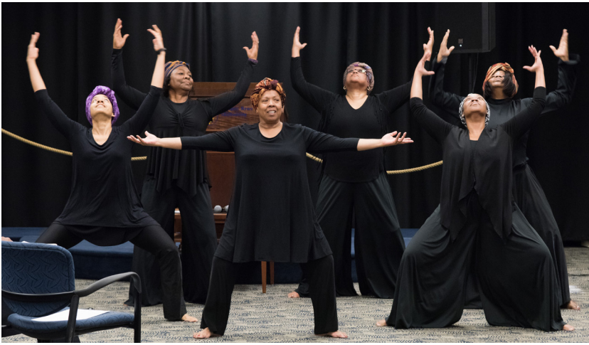
The Arts in Motion NNS Dancers perform during the African American Shipbuilders Association's annual Black History Month Celebration.