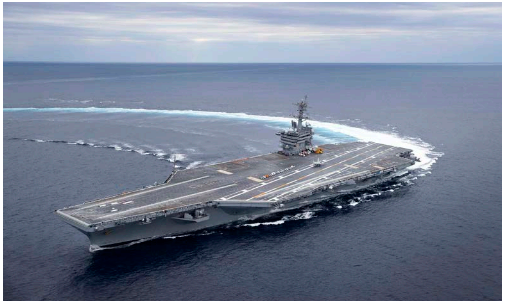
USS Abraham Lincoln (CVN 72) conducts high-speed turn drills in the Atlantic Ocean during sea trials.

The next carrier in line for its RCOH is the USS George Washington (CVN 73).