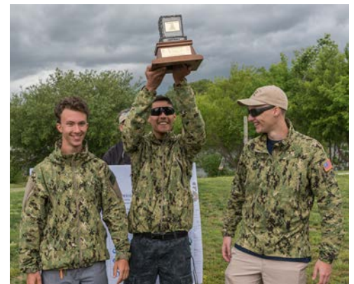
Team "Barracuda" celebrates first place at the 10th Annual SNAME Boat Design Competition at The Mariners' Museum May 6.

In addition, there was a new set of races this year – the "10th Anniversary Championship." The winning teams from the 2015 competition ("Your Worst Anemone" from Jamestown High School) and the 2016 competition ("Monstro" from Poquoson High School) competed in a high-speed race and slalom race. The race was an extremely close competition and "Monstro" was crowned the winner. Special thanks to all competitors, spectators and volunteers who made this year's event possible.